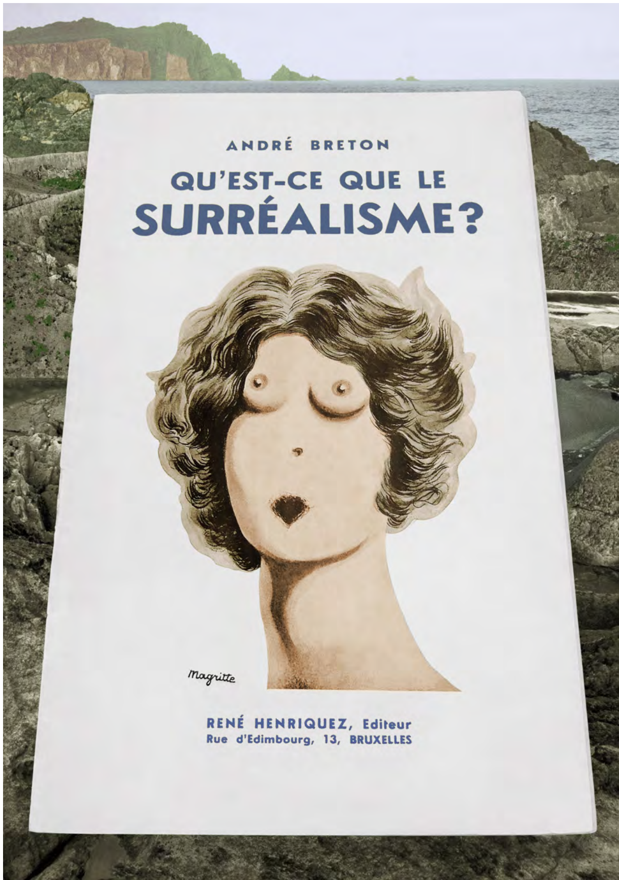
René Magritte, book cover art for Qu'est-ce que le surréalisme ,