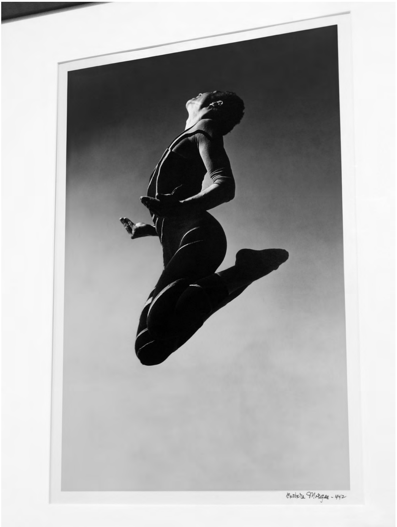
Merce Cunningham, Totem Ancestor , Barbara Morgan, 1942

Scott Nichols Gallery, San Francisco, 2008