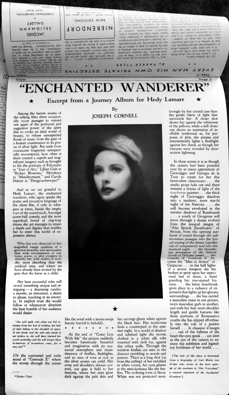
Joseph Cornell, Enchanted Wanderer , Excerpt from A Journey Album for Hedy Lamarr Lamarr's face is collaged over a portrait by Giorgione ca. 1500. View magazine, December, 1941