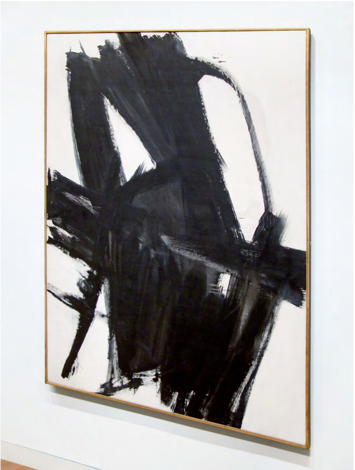
Merce C. , Franz Kline, 1961 (VL 2008)