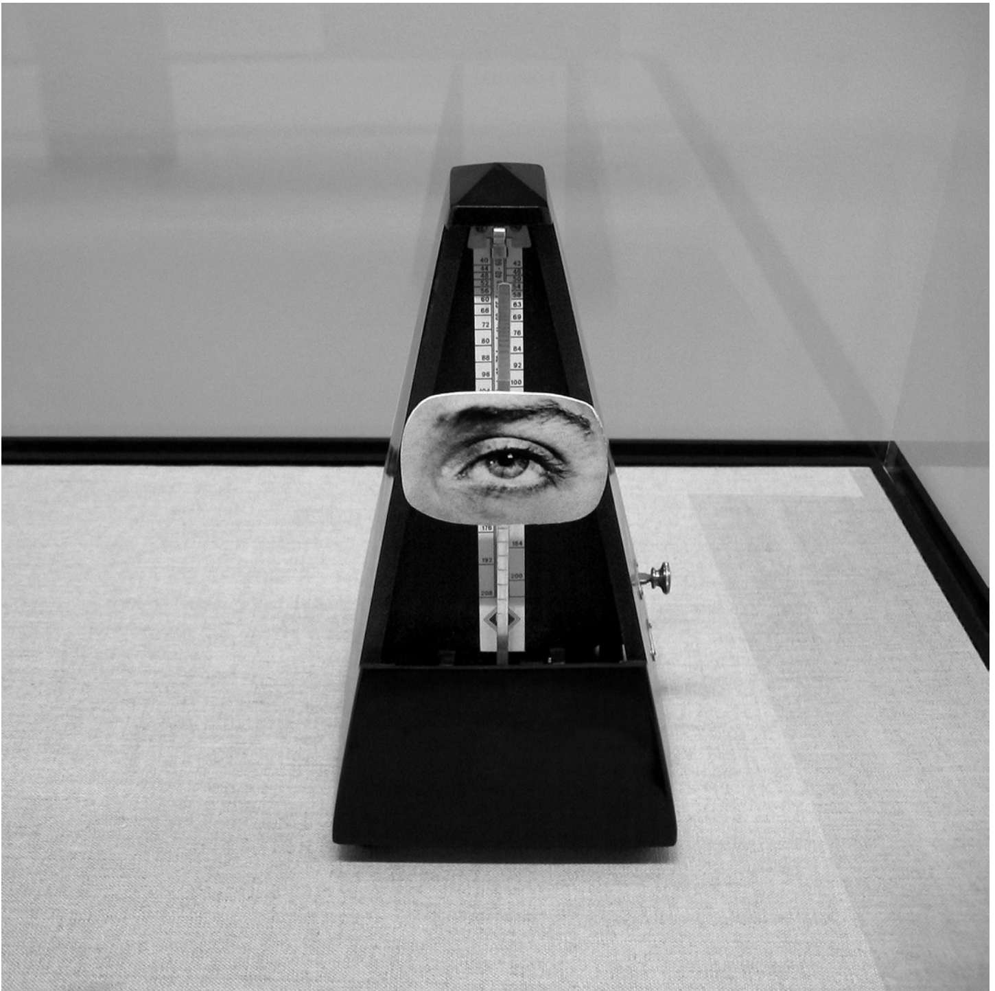
Man Ray, Indestructible Object , 1923/1933/1964