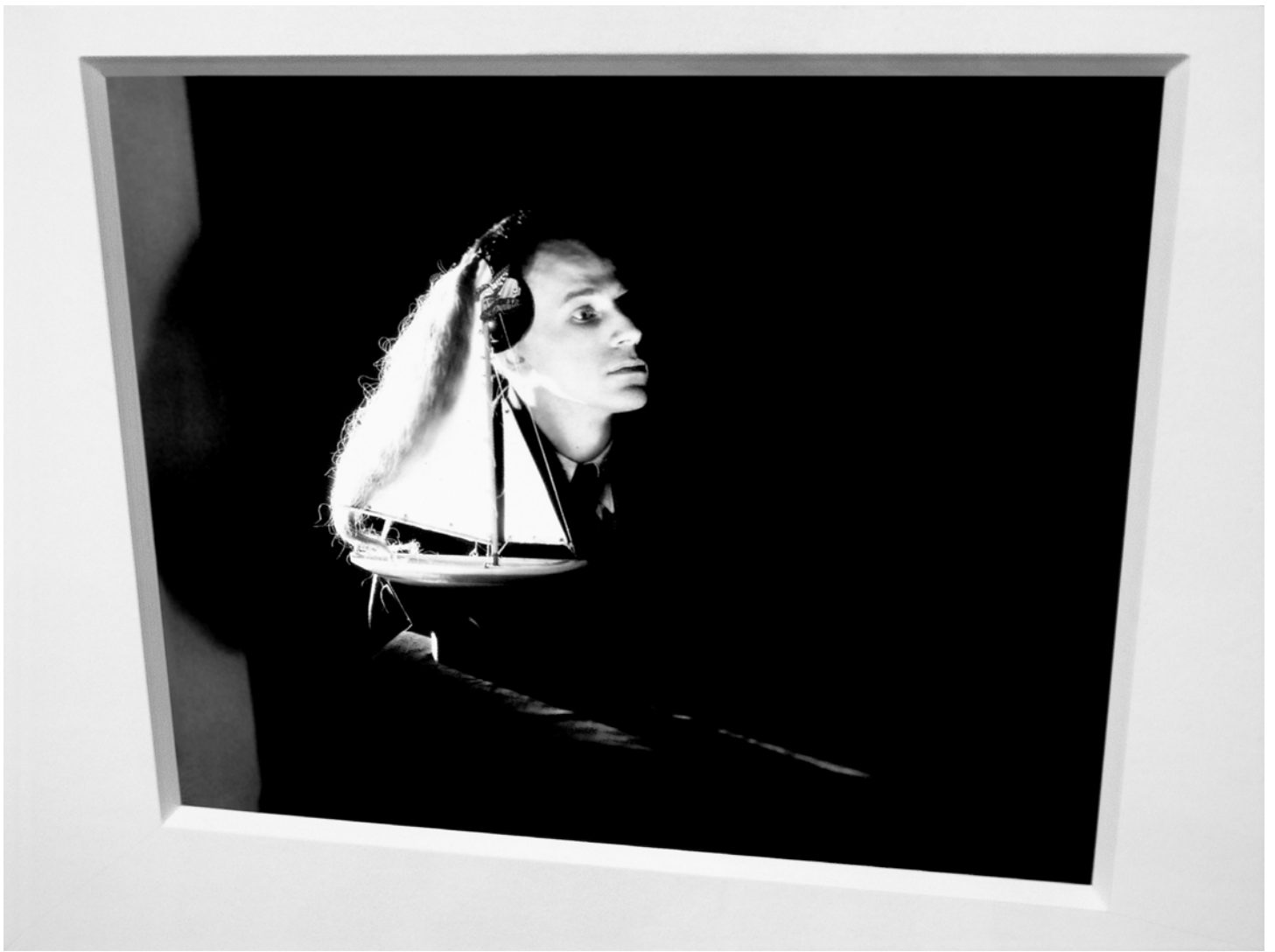
Lee Miller, Joseph Cornell with One of His Objects , 1933 Norton Simon Museum, Pasadena, 2007